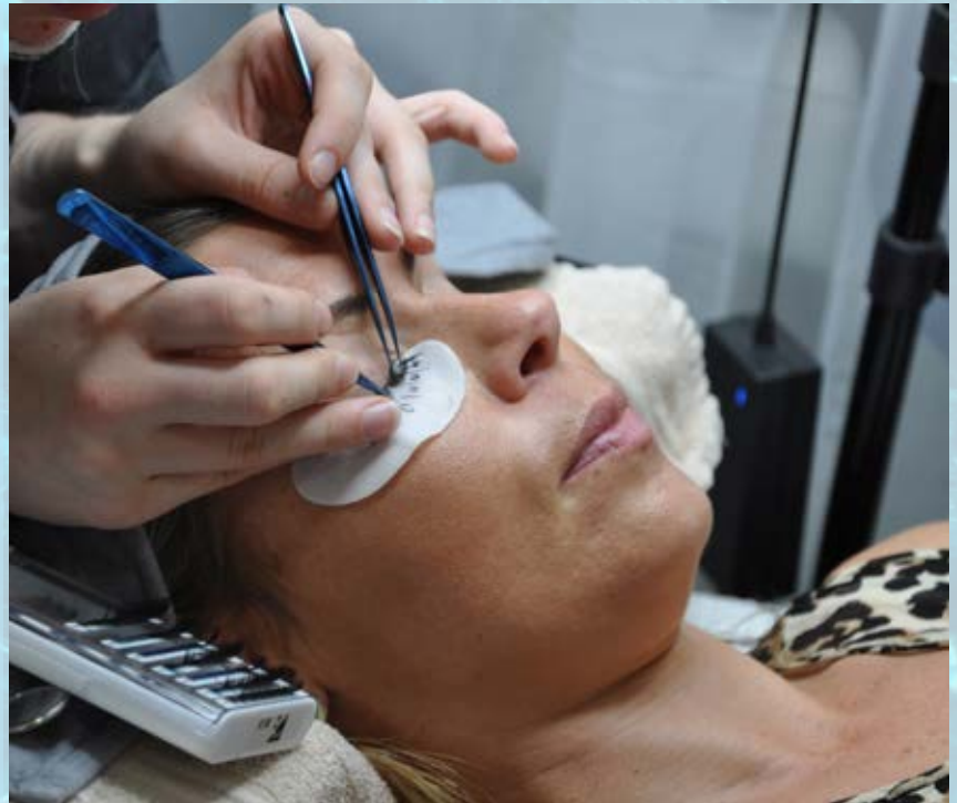
One by one... Each eyelash extension is applied individually.

Our message to her, and all young people, is we believe in you. Just keep going.